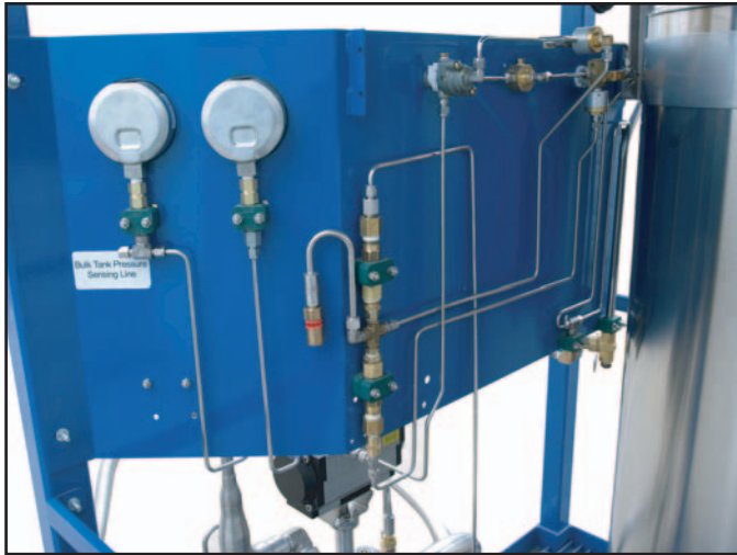
ROBUST STAINLESS STEEL PLUMBING AND COMPONENTS