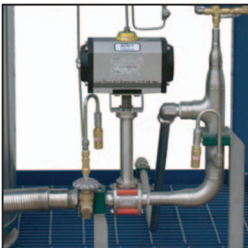
Automatic Fill and Safety Shut-Down Valve