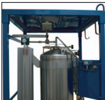
Automatic Pressure Building Valve and Coil