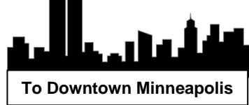
Chart Industries, Inc. 407 7 th Street N.W. New Prague, MN 56071-1000 (952) 758-4484